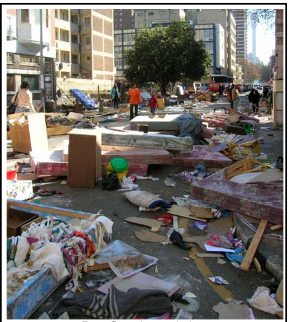
Bree Chambers eviction

Undoubtedly, there are many 'bad' buildings in Johannesburg, but people have chosen to live in them for lack of any real alternatives. COHRE has found that most residents of 'bad' buildings earn less than R 1 000 (US$ 155) per month and cannot afford the low-cost housing options that the City provides. Also, the backlog for low-cost housing is now some 18 000 households. [http://www.cohre.org/downloads/ffm-johannesburg.pdf]